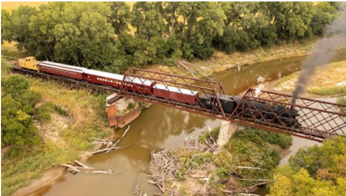
A&SV's former Santa Fe 3415, Pacific type 4-6-2, crossed the Smoky Hill River near Enterprise, Kansas, September 15, 2023. American Heritage helped paint the train a uniform paint scheme in Spring 2023.

Former Santa Fe 3415 will wrap up some 28 trips in 2023 in October 2023. The 1472-inspection is due and will require 3415's flues to be removed and inspected. This major inspection is expected to take 1 or 2 years. Fortunately, diesel #4 will be keeping the trains rolling between Abilene and Enterprise, Kansas.