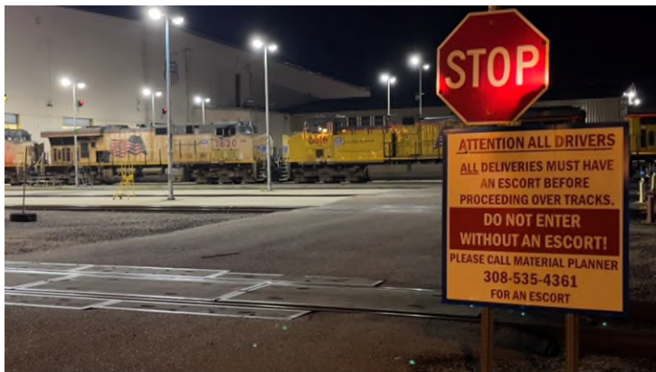
Federal Railroad Administration (FRA) inspectors visited Union Pacific's Bailey Yard at North Platte, Nebraska, during July and August 2023.