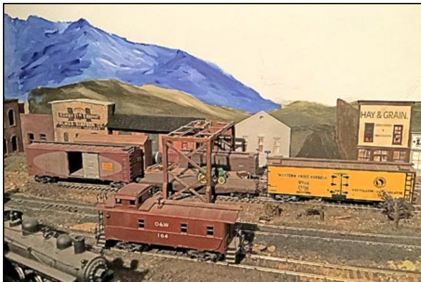
The transfer crane on Denny's model Lake City and Ouray Railroad.