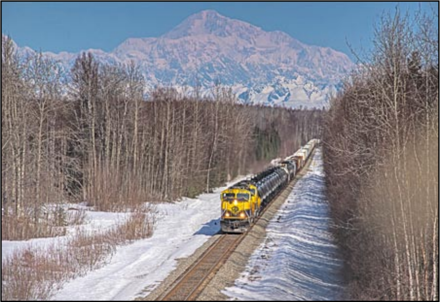
Alaska Railroad 4006 brings a rare daylight freight south as Denali peak stands tall in the background.