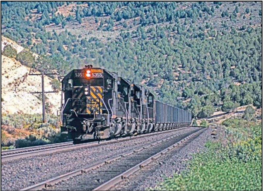
Rio Grande 5355 leads a train westbound at Detour.