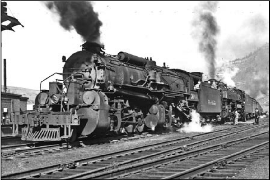
D&RGW #3404 is the helper for #1801 on the passenger train that will climb out of Minturn, Colorado, and then up Tennessee Pass on October 6, 1940.