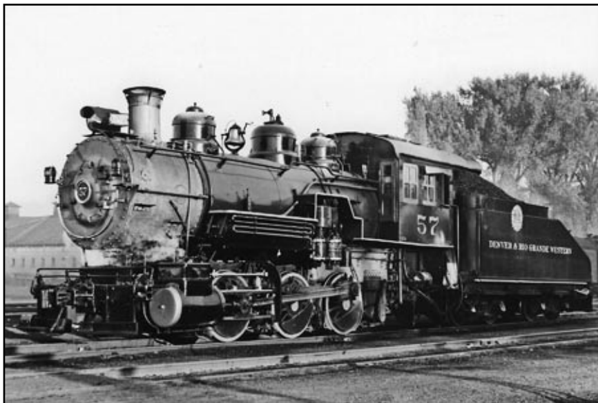
This 0-6-0 switcher, D&RGW #57, was found at Salt Lake City, Utah, on October 14, 1939.