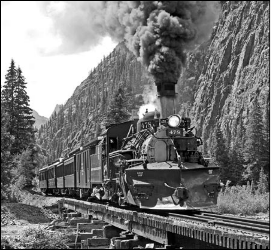
D&SNG Railfest photo special with K-28 #478 crossing the Las Animas River just south of Silverton, CO on 20 August 2011.