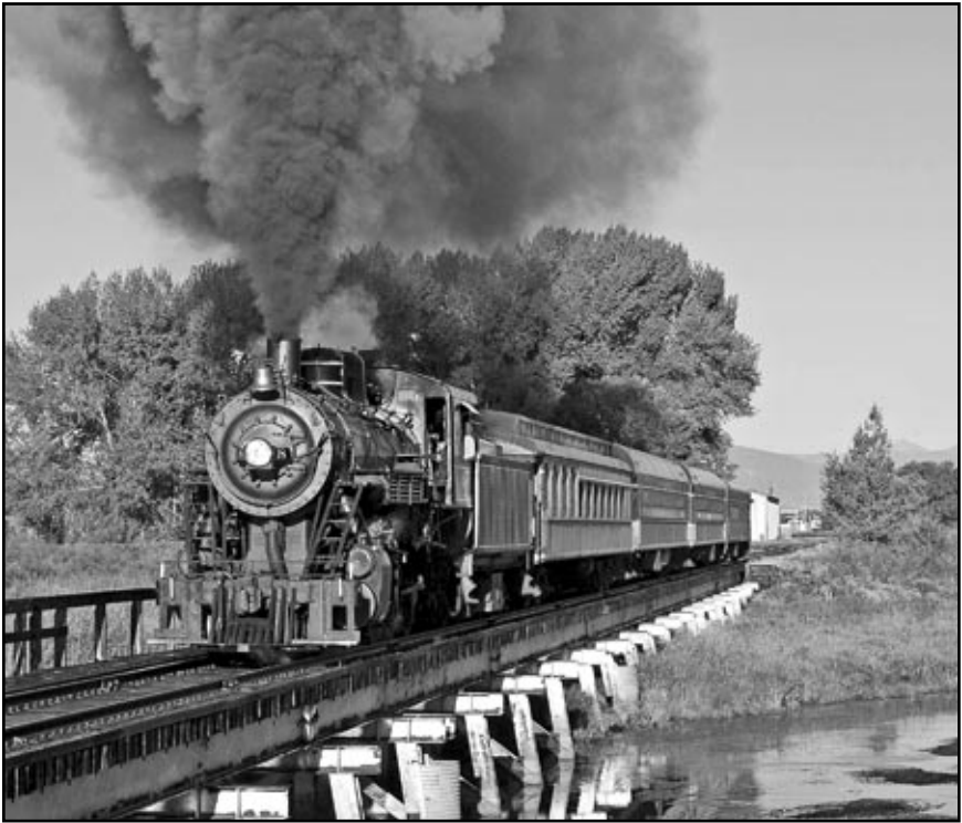
Rio Grande Scenic Railroad #18 performs a run-by across the Rio Grande River during a photographer special on August 22, 2011.

The contractor building the light rail line from downtown Denver to Golden has donated $50,000 worth of labor, materials and equipment for a project at the Colorado Railroad Museum. The Regional Transportation District says Denver Transit Construction Group built 300 feet of track for the museum in Golden in one day at the end of August.