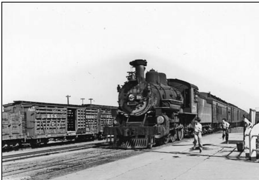
D&RGW #779 is at Montrose. What better fun for two boys than chasing a train! Note the RGS stock car to the left.