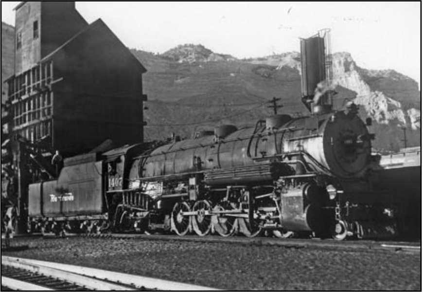
D&RGW #1407 taking water with the coal chute at Helper, Utah, to the left.