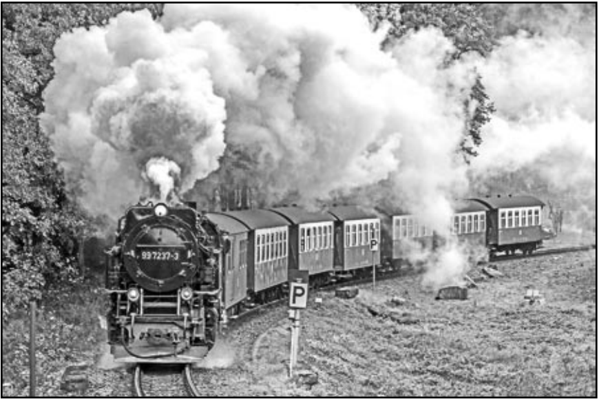
A stubby meter-gauge Harz Railway 2-10-2 begins its climb from Drei Annen Hohne to the top of Brocken Mountain.