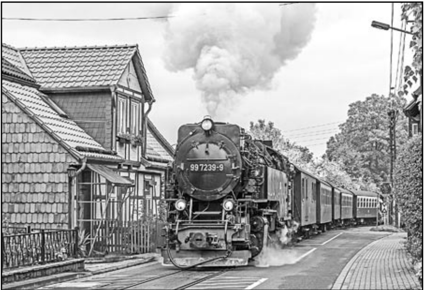
After departing the Wernigerode High School halt there is a short segment of street running that adds another layer of personality to the Harz Railway.