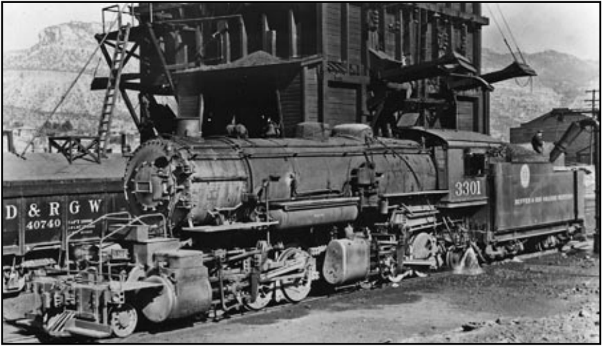
D&RGW #3301, a 2-6-6-2, is taking water at Helper, Utah, on an unknown date.