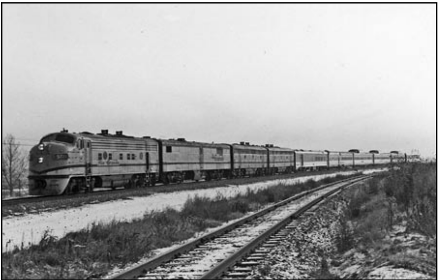
D&RGW #5771 is westbound at Tennyson Street in Arvada, with a destination of Salt Lake City on December 6, 1982.