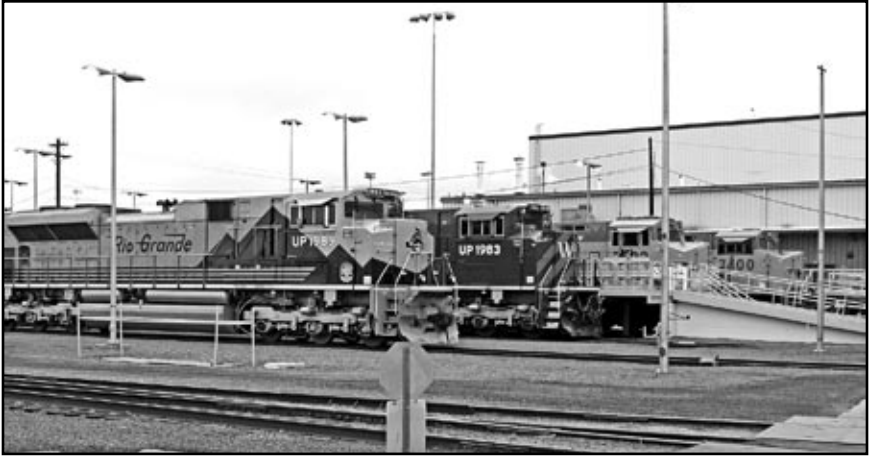
The Bailey Yard tour on September 16, 2011, included five of the six total Heritage diesel units on display at the shops in North Platte.

Bailey yard. I was pleasantly surprised to see that two other members of the Rocky Mountain Railroad Club, who had decided to see what “going east” would provide, were also on the bus. The Bailey Yard is 8-miles long and 2-miles wide. It is the largest railroad hump yard in the world, handling and servicing about 140 trains daily. During our 2-hour bus tour, we visited the east and west hump yards, the coal yard, the container and piggy-back yards, the repair facilities, the loco shops and all 350 miles of track in the complex. We enjoyed seeing a locomotive crane lifting a locomotive. We also enjoyed the car repair demonstrations. There were five of the six Heritage Diesel Units on display. I enjoyed each and every moment I was there.