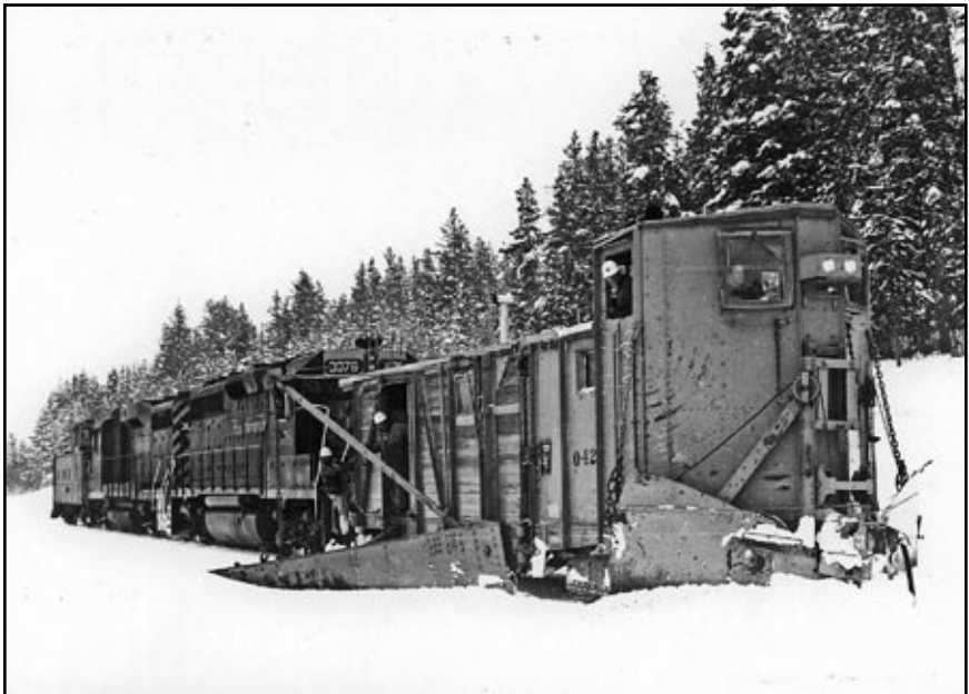
D&RGW spreader #042 and unit #3076 plowing westbound at west portal near Winter Park, Colorado on January 3, 1981.