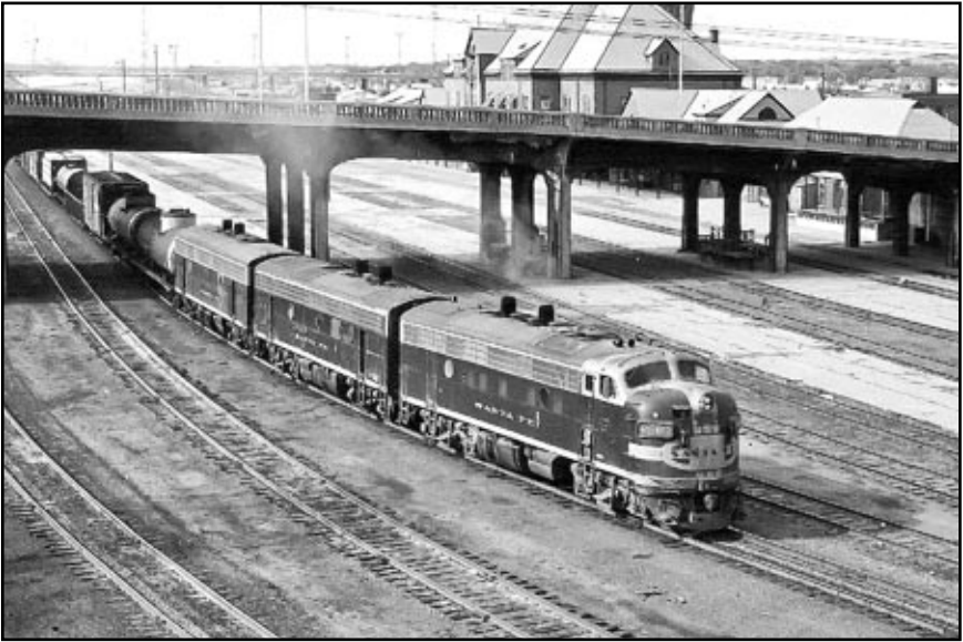
Eastbound manifest between Union Avenue and Main Street Bridges on the Loop Line.